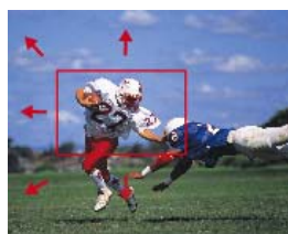
Digital Pan / Tilt

The IC-1520DPg is a compact 1.3 megapixels network camera with digital pan-tilt-zoom to enhance your viewing and monitoring experience. Built-in a wide angle lens, the IC-1520DPg has a panorama of 128° in horizontal and 99° in vertical. You can use a smaller viewing window to move around like a magnifier. With a preset path, the IC-1520DPg will cruise along the path. The IC-1520DPg breaks the viewing area limit and provides the flexibility to meet your needs.